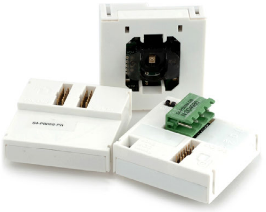
S4-PB05 is connected to the control unit with CAN-Bus connections while the connector is connected to each other with a flat cable.

The S4-PB06 is a push button that supports 4 types of illumination: center, single light (halo), dual light (center/halo) and multi-light (center/2 x halo).