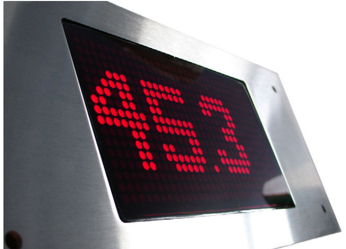
S4-MIO3 has an extra wide dot matrix of 32x16 dots. S4-MIO3 can be fitted to both landscape and portrait, which gives great flexibility for how information is displayed. The display above shows the height above the ground instead of the floor - one of our many tailor-made solutions.

Floor indicators can be ordered in a variety of colors on the LED's and with both shiny and scratch-resistant window, depending on the wishes and the environment. Our floor indicators have also built-in arrival signal that sounds when the lift has reached its destination.